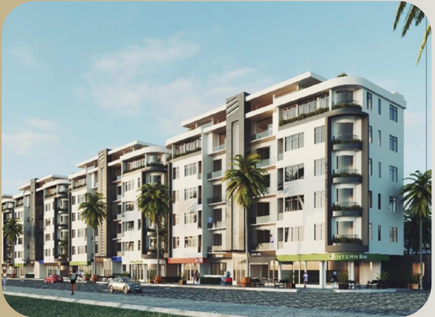
Helium Apartments ... Currently Under Construction