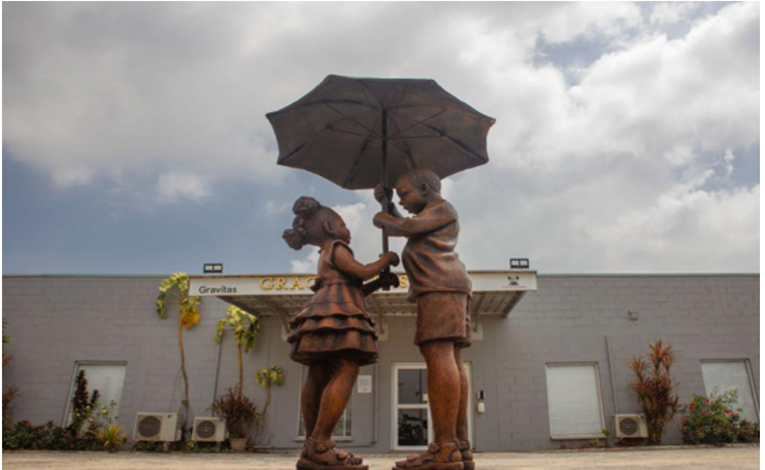
Art on Gracefield Island