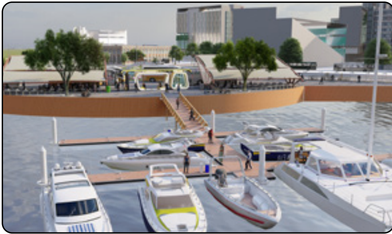
One of three marinas on Gracefield Island