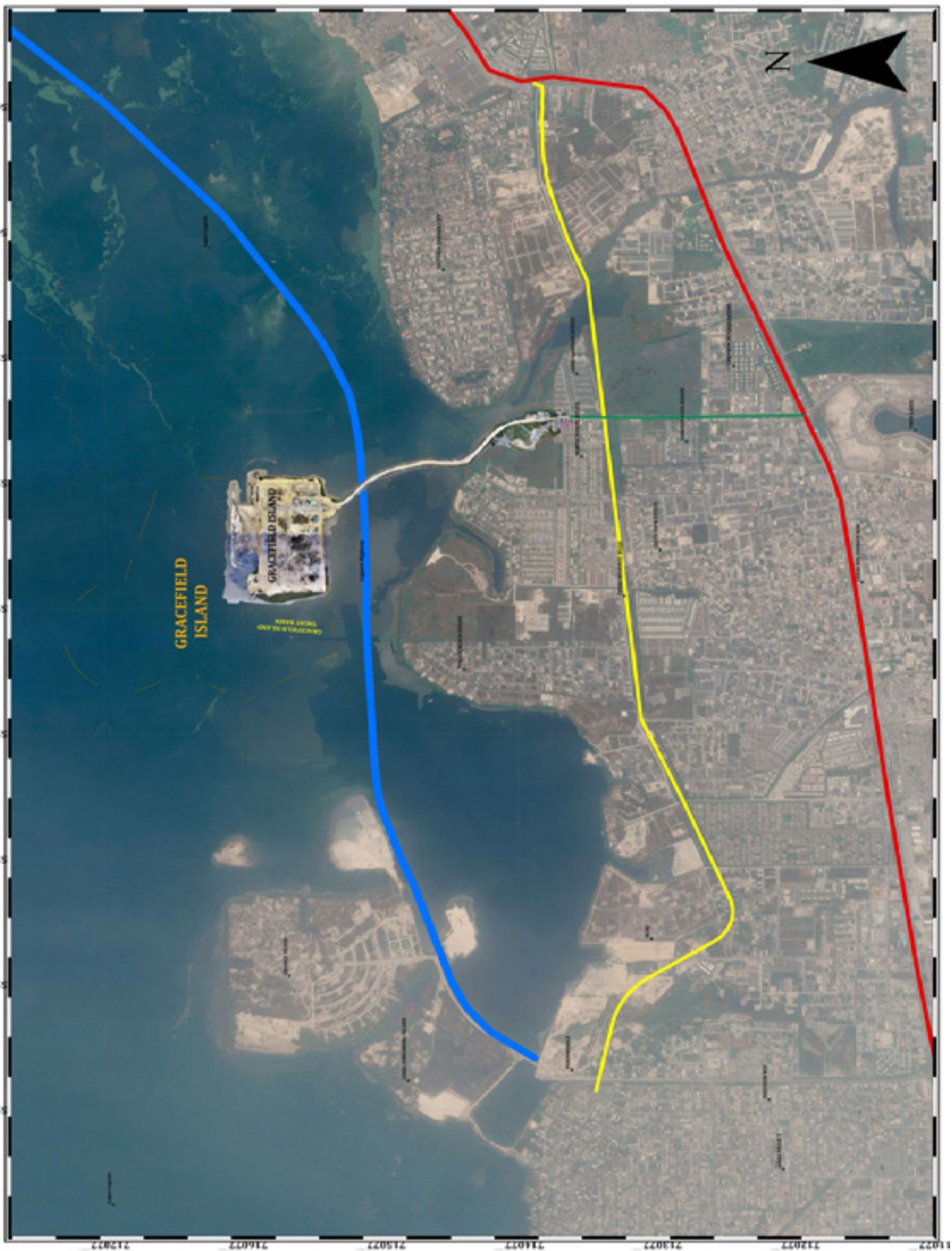
Lekki Regional Road (V.G.C to Freedom Way) under construction.