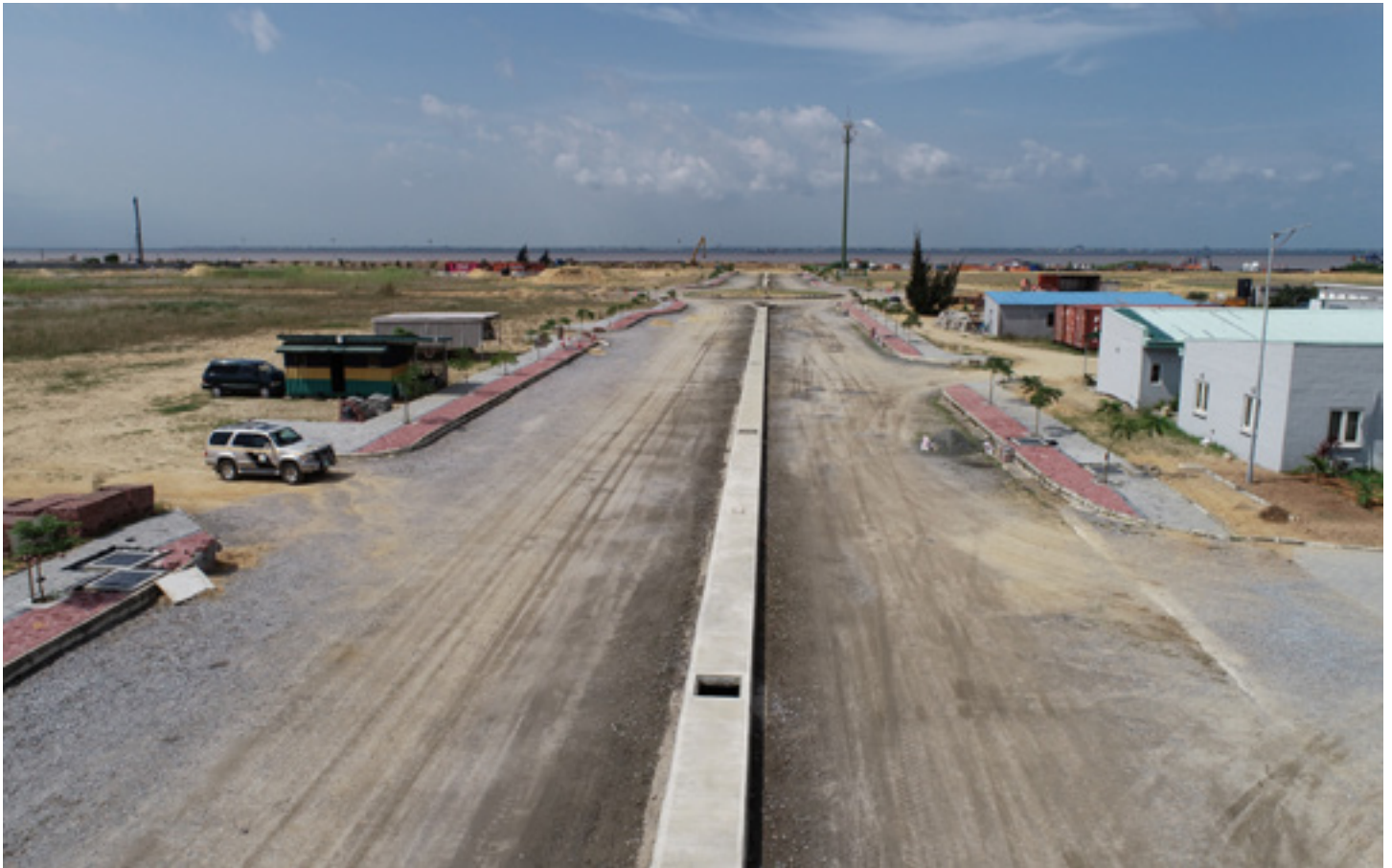
Infrastructure construction continues apace